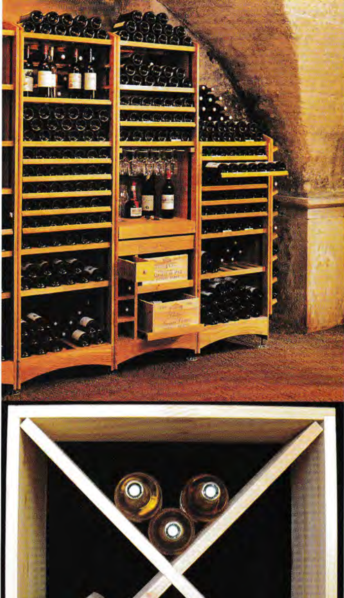
Perfect fit: whether you want to store 100 or 1.000 bottles, have one zone or three. convert a tiny cupboard or huge garage, the perfect storage solution is out there

Roger Gillet swears by his Cavovin honeycomb units. Initially the wine storage business was just a sideline to Gillet's wine artefact shop